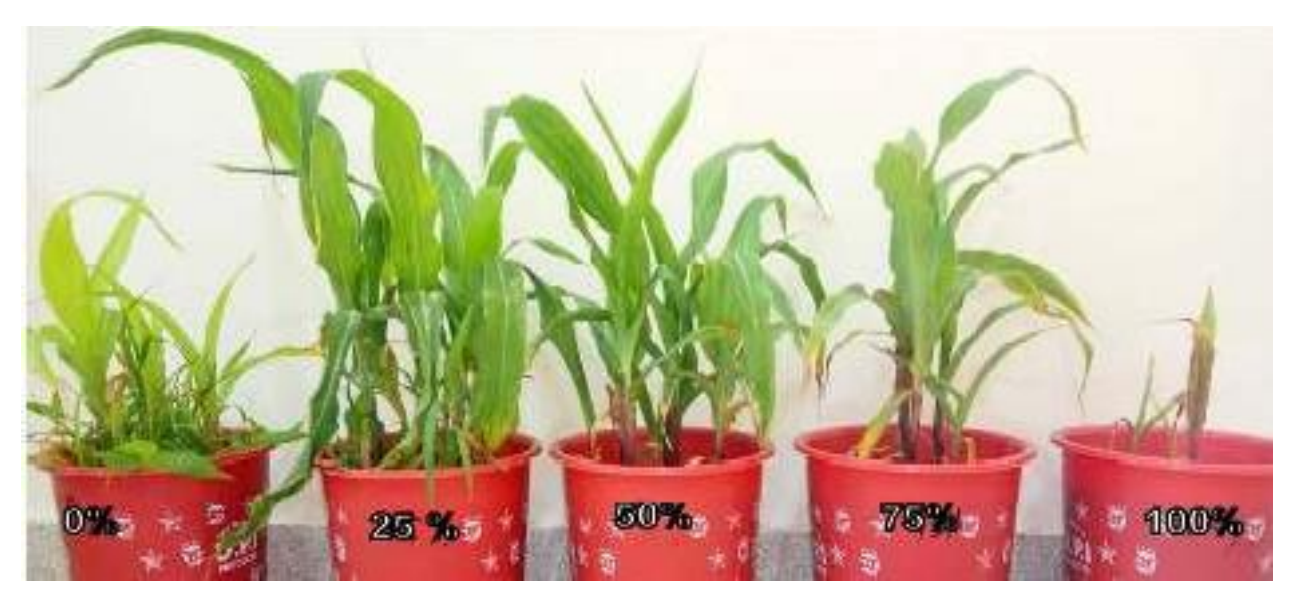
Photo showed the effect of parthenium derived extract on weed density and growth performance of maize crop.

Parthenium derived extract at higher concentration (100%) inhibit the crop growth and the successfully control the weeds. The promising result of Parthenium derived extract (25%) could be used asbio stimulants for maize crop and as bio-herbicide for sustainable weed management.